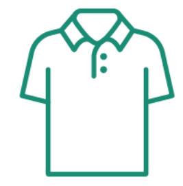
426 referrals for clothing, household items, and enrichments activities, so that children can play and celebrate.